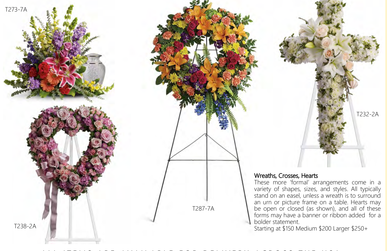
ALL ITEMS ARE AVAILABLE FOR DELIVERY ACROSS THE USA